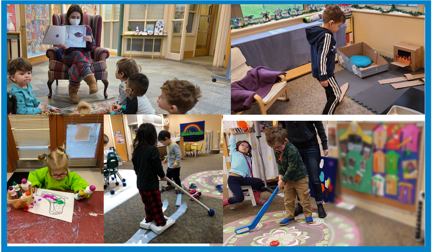
Winter is full of fun!